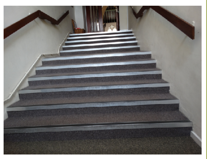
Access to the Church Rooms from the street, and from the foyer to the church is currently difficult for those with reduced mobility, and parents with buggies or pushchairs