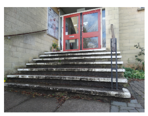
Ill-fitting entrance doors are a security risk and let heat out

The main entrance doors to the C h u r c h Rooms will be replaced with modern doors which are more secure and retain heat. The windows in