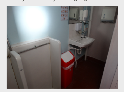
The toilets do not come up to modern standards

All the toilets in the Church Rooms will be upgraded, bringing them up to modern standards, improving accessibility and baby changing facilities.